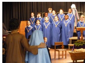
For information about and for vacancies in our Diocesan Schools see Diocesan Education Service website . A new Deputy Headship vacancy has currently arisen